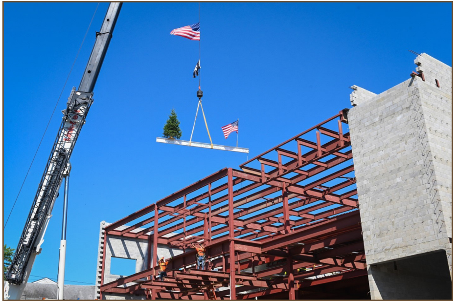
A Topping-Off Ceremony celebrating the building progress was held on July 14. About 200 members of the community were on hand to join in the festivities and sign a ceremonial beam that was lifted into place on the building.

As always, we are grateful for the support of Pennsbury Township. We couldn't offer our outstanding programs or build this new library without the support of our municipal partners. •