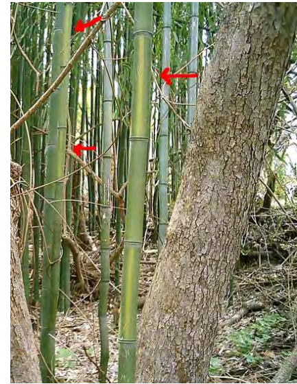
Yellow groove bamboo Caryn Rickel, Institute of Invasive Bamboo Research

Due to the thick, tall nature of the colonies it produces, bamboo virtually eliminates all understory plants that stand in its way. In effect, it leaves little appropriate habitat for wildlife, sharply decreasing biodiversity. Once established in an area, it is quite difficult to remove.