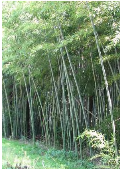
Timber bamboo

These three bamboo species thrive in full sun, but will grow well in sparsely wooded secondary forests. The most vigorous growth occurs in moist, deep, loamy soils, where these bamboo can spread rapidly.